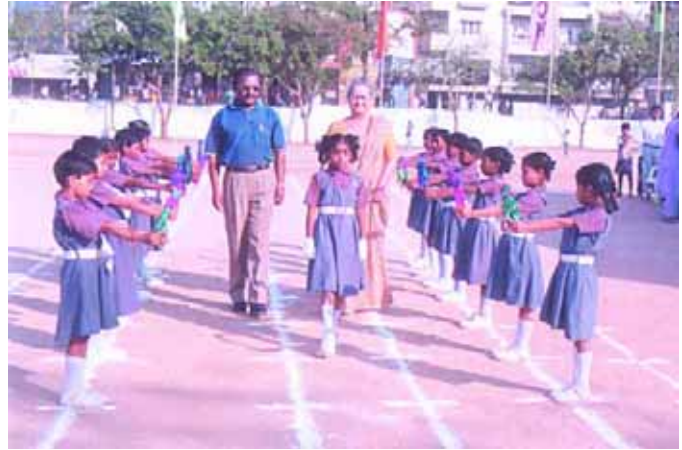
Rotary Club of Secunderabad West organized an eye camp for the school children in March 2005.

The mothers of the students celebrated International Women's Day in March by attending a 'tea party' organized by the teaching staff and participating in some indoor games. It was a few hours of fun and laughter for all who were present.